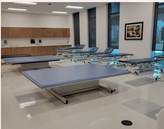
Specialty teaching rooms; hi-low tables