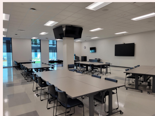
Mental Health/Roundtable rooms