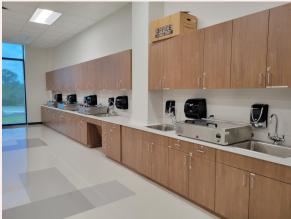
Lab classrooms, splinting, etc.