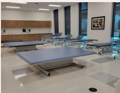
Specialty teaching rooms; hi-low tables