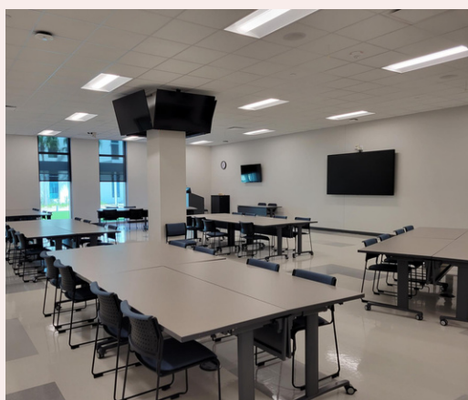
Mental Health/Roundtable rooms

Saturday Nov. 5 - Sunday Nov. 6, 2022 NOVA Southeastern University. 3400 Gulf to Bay Boulevard Clearwater, FL 33579