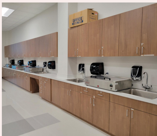
Lab classrooms, splinting, etc.